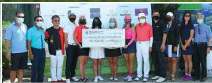
Mackenzie Health Foundation