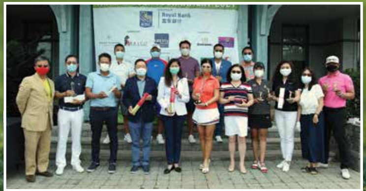
Winners of the tournament pictured with organizers and dignitaries 高爾夫球賽各得獎者與主辦機構及頒獎嘉賓合照