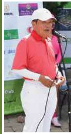
Senator Victor Oh 參議員胡子修