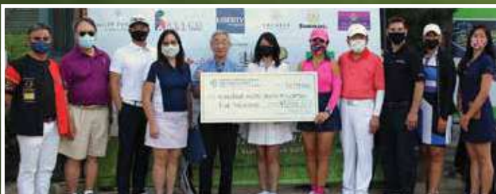
Hong Fook Mental Health Association 康福心理健康協會