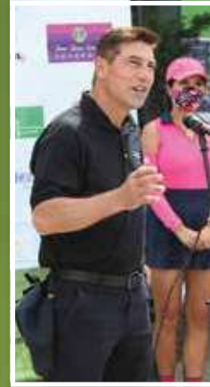
Acting Mayor of Richmond Hill Joe DiPaola 烈治文山市代市長Joe DiPaola