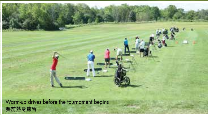
Warm-up drives before the tournament begins 賽前熱身練習