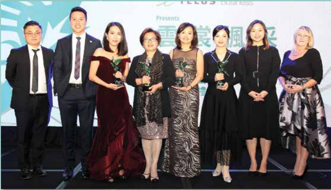
■ The four winners and the award sponsors: H&F Jewellery, ReMax Excel, HKETO Toronto and TD Wealth.