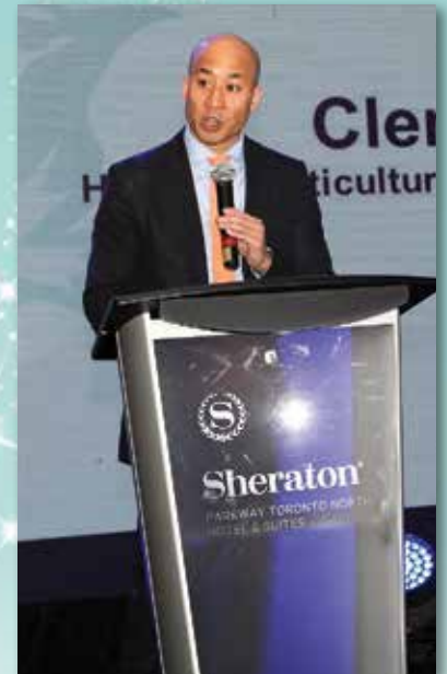
■ Event title sponsor: Telus Business