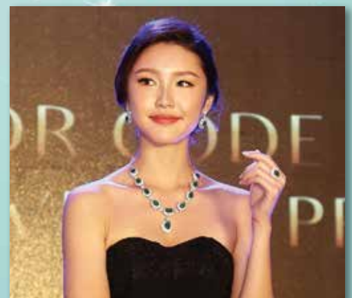
■ Game of the night: price guessing of a set of emerald necklace and ring.