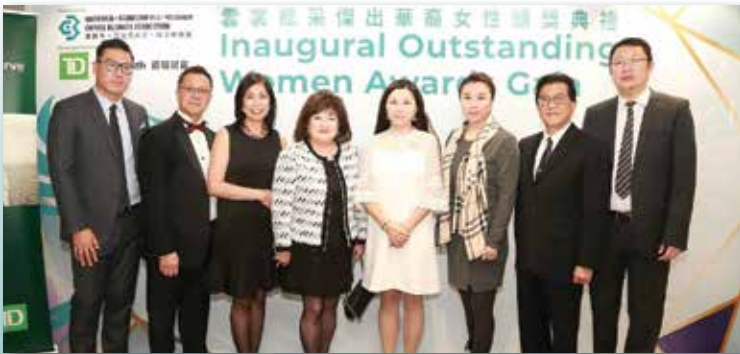
■ Representatives from MCBA and SYRCBA attended the award ceremony.