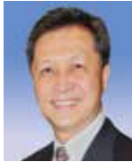
Message from the President 會長的 話