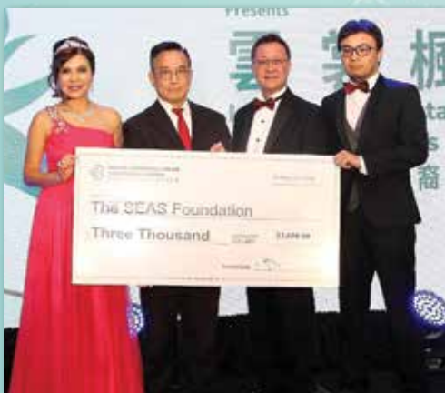
■ Part of the event proceeds is donated to SEAS Foundation