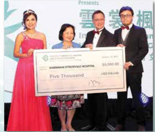
■ Part of the event proceeds is donated to Markham Stouffville Hospital