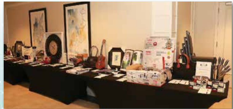
■ Silent auction corner