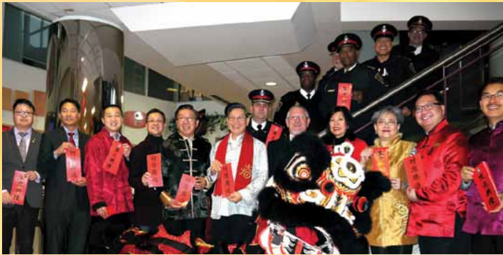
■ The group wishes everybody a very happy and prosperous Year of the Monkey.