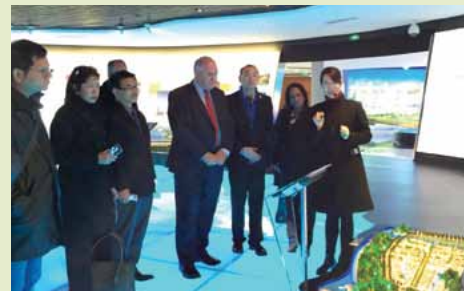
■ Touring the Suzhou Industrial Park. 參觀蘇州工業園。

This former president of RHMCSBA has another title – President of the Canadian Municipal Business Gateway (CMBG). He said that this tour gave him a better