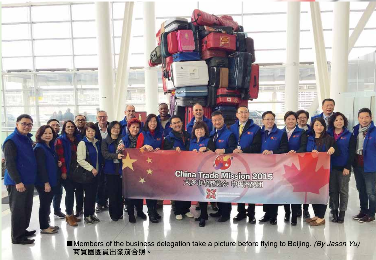
Members of the business delegation take a picture before flying to Beijing. 商貿團團員出發前合照。