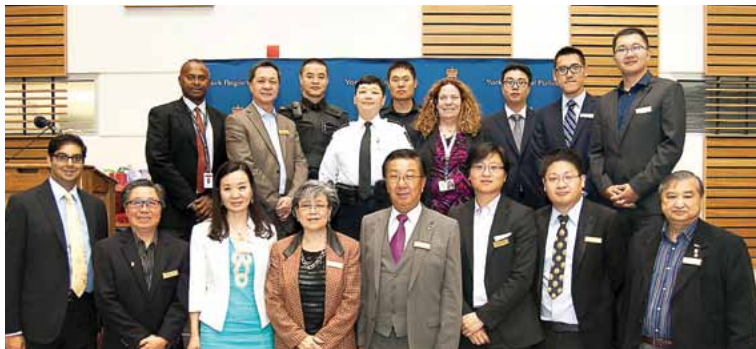
■ RHCBA's board members with YRP officers.