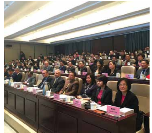
Members attending business seminar. 團員出席商機講座。