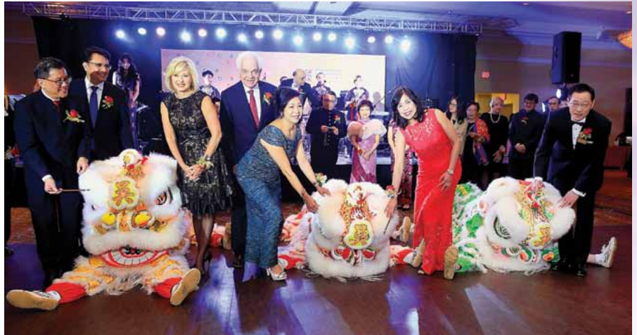
■ The four presidents of CGTCBA and VIPs dot eyes for the dancing lions.

由大多市華商總會舉辦的第19屆「華商之夜」於2月27日在Pearson Convention Centre舉行，出席的嘉賓超過720人。大會的主講嘉賓為大多倫多機場管理局行政總裁伍翹楚。出席者包括多位國會議員、市長、省市議員、政商界人士和華人社區領袖。