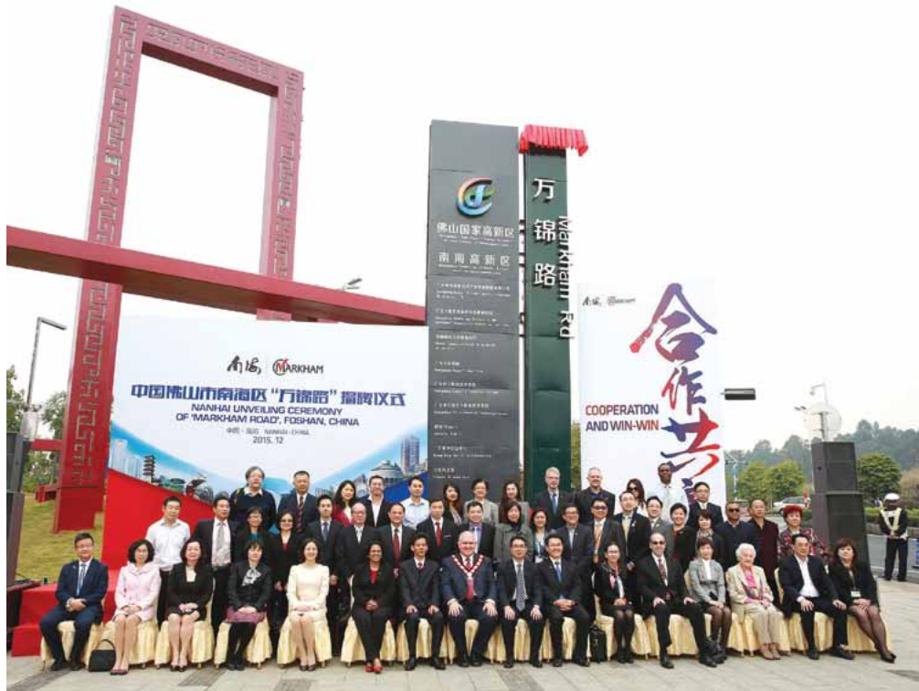
■ “Markham Road” unveiling in Nanhai District, Foshan City.