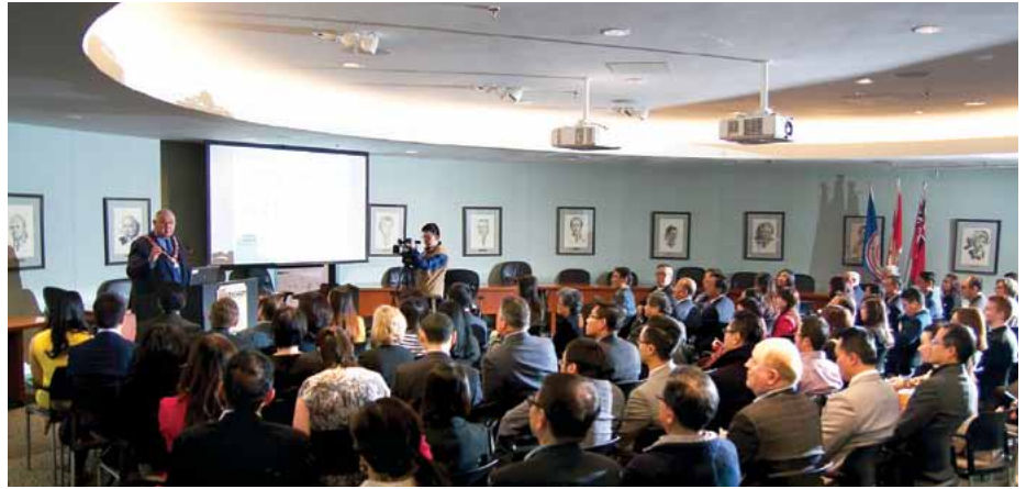
■ Markham Mayor Frank Scarpitti addresses to over 100 attendees.

今年3月底，本會再次獲萬錦市政府贊助，在市政中心舉辦商業網絡活動，讓商界人士了解該市的經濟發展和機遇。另外，本會去年10月底在位於奧羅拉的新警察總部舉辦商業網絡活動，加強商界人士對約克區警隊的認識，同時提高他們對防止商業罪案的意識。