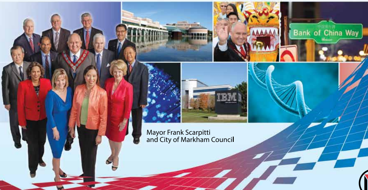
Mayor Frank Scarpitti and City of Markham Council