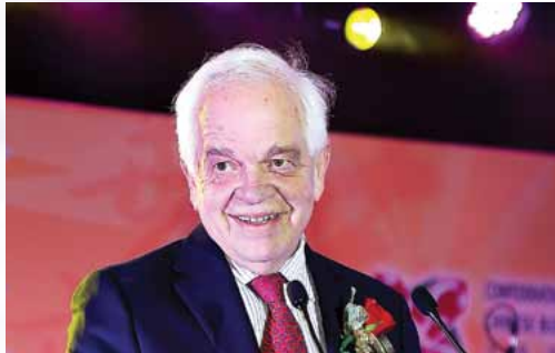
■ The Honourable John McCallum , Minister of Immigration, Refugees and Citizenship.