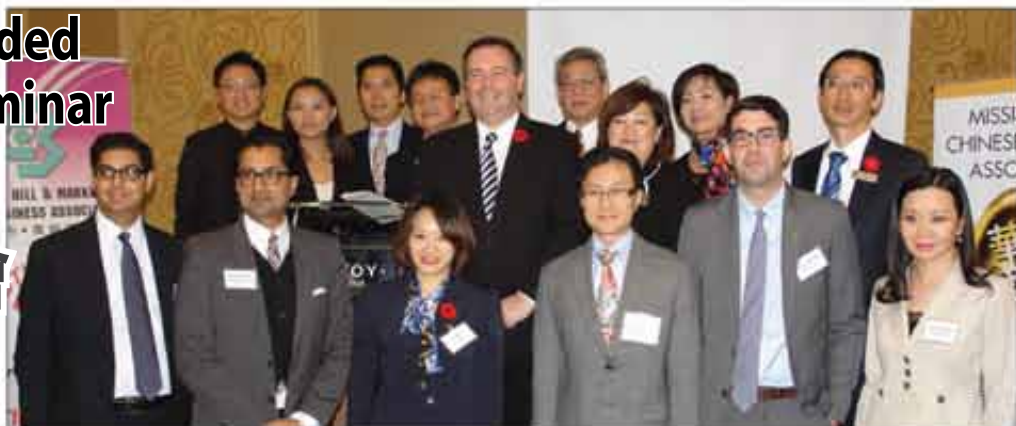
▲ Minister Jason Kenney with CGTCBA's directors and the seminar speakers. 康尼部長與大多市華商總會會董及研討會的講者合照。

Other topics included 2015 Economic Outlook, Scientific Research & Experimental Development, Business Succession Planning, Increase the Competitive Edge but NOT the IT Costs of Your Business, Estate Planning and Trust, Mortgage and Business, Important Things You Need to Know about Business Insurance, and A Diagnostic Approach to Treasury.