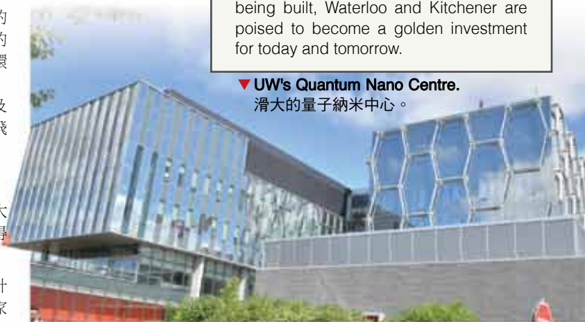
▼ UW's Quantum Nano Centre. 滑大的量子納米中心。

請VeloCity，本來還以為只是搬到一個有空調的「高級宿舍」，但其實是進入了一個創業的綠色通道。他和項目主管以及團隊成員集思廣益，決定要做出一個大型室內地圖指引軟件，讓在校園和商場內「找不到北」的人可以找到方向，取名叫「MappedIn」。