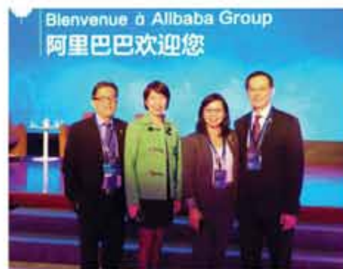
▲ The four presidents of CGTCBA visit the headquarters of the Alibaba Group in Hangzhou. 華商總會四位會長參觀阿里巴巴集團在杭州的總部。

and communications technologies sectors. The signings are valued at more than $2.5 billion and are expected to create more than 2,000 new jobs in the Canadian market.