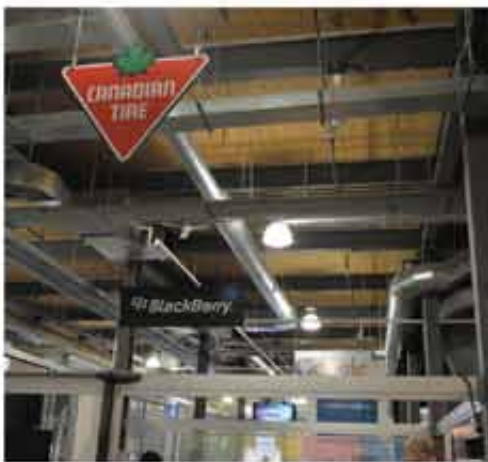
▲ Canadian retail giant Canadian Tire has its innovation office at Communitech. 眾多加拿大大公司如Canadian Tire在此設有研發辦公室。

Back to 1957 when the University was just opened, it had 74 students, while the city of Waterloo was officially incorporated from a village to a city in 1948 with population of 1,237, ranking only number 56 in Canada's municipal districts. In 2012, the University had 30,000 full-and part-time undergrads, 5,100 full-and part-time grad students. Meanwhile the population of