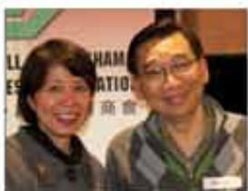
Kai Tao Dragon Fire Distribution Inc.