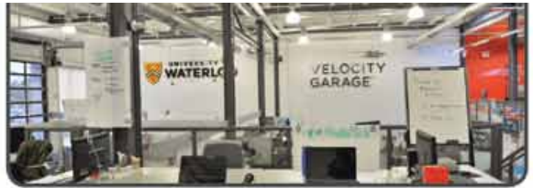
▲UW's VeloCity program has its garage at Communitech. 滑鐵盧大學的VeloCity培育計劃在Communitech設有實習辦公室。

滑鐵盧市的「大學街」是名副其實的大學街，從西往東分別是滑鐵盧大學、Wilfrid Laurier大學和Conestoga學院。三所大學風頭過人。根據滑鐵盧市經濟發展辦公室的數據，滑大連續二十一年被評為加拿大最創新的大學學府，本國22%的IT公司的成立都和其培育計劃息息相關。Wilfrid Laurier大學的商科和數學教學優良，而Conestoga學院就有滑鐵盧地區半數的人口進入學習過，其中87%的畢業生每年就為當地經濟貢獻超過10億元。