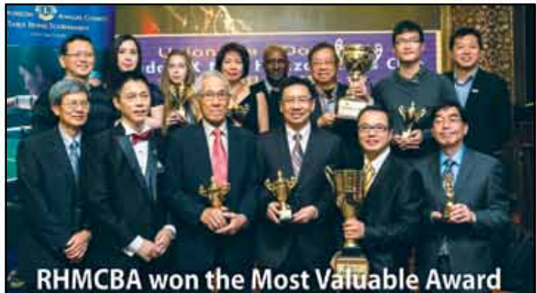
RHMBCA won the Most Valuable Award