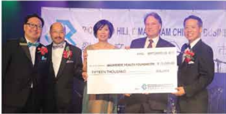
▲Last year RHMCA donated $15,000 to help install a second MRI scanner to Mackenzie Richmond Hill Hospital. 去年商會捐款15,000元協助烈治文山醫院添置第二部磁力共振掃描機。希望更多人捐款給醫院，以便醫院能進一步提高質量。

醫院還安裝了眾多智能設備。其中還包括安裝在每個病房內的「智能前台」，隨時向醫護人員提供病人的背景資料和病況，以便他們迅速作出反應。「智能識別卡」是醫院員工的身分代碼，可隨時顯示醫護人員的位置，確保能最快取得溝通。「洗手監督」則是院內的一套提示系統，通過感應器提醒醫護人員是否忘記洗手。