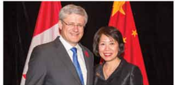
▲ 與總理哈珀合照。

在此我要感謝商會所有會董，我的家人和道明集團的長期支持。作為商會主席，我個人在2014年裡也收穫良多。首先，是和本世紀最成功的商界精英之一的創普先生見面，以及和本國的宇航英雄Chris Hadfield在佛州見面。其次，是在大多市華商總會