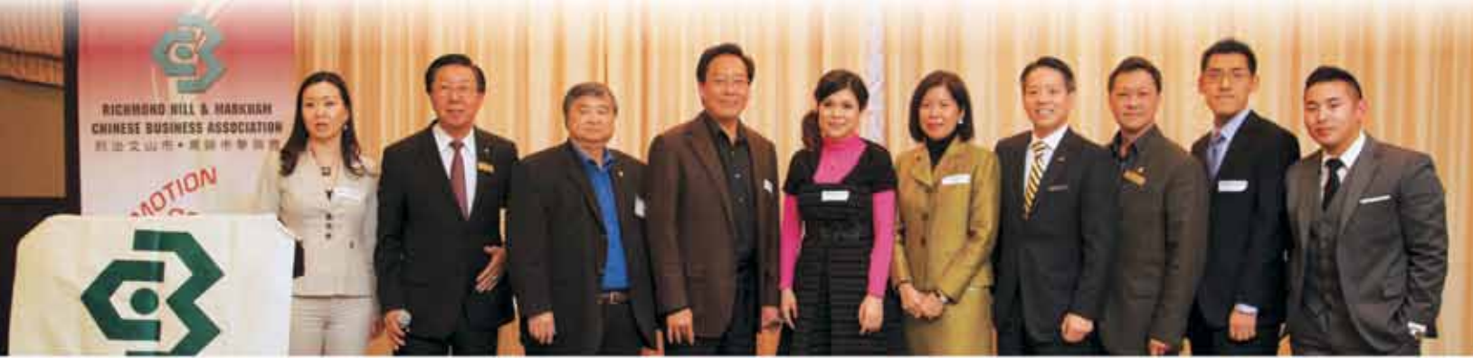
▲ Directors attending the networking night. Most absentees have gone to China on the trade mission.