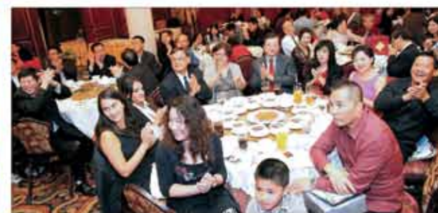
▼ Guests enjoying the show.