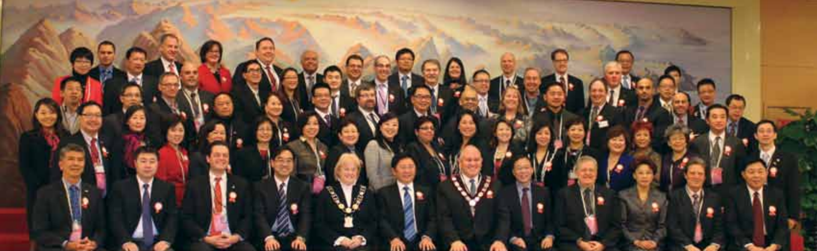
▲ The trade delegation with the officials of National Development and Reform Commission, and the government officials of Fun Hill District. 商貿團團員包括6位市長及副市長與房山區政府官員和中國發展改革委員會官員合照。