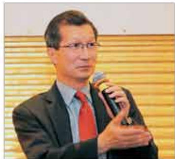
▲ The Honourable Michael Chan , Minister of Tourism and Culture hopes the attendees have fun.