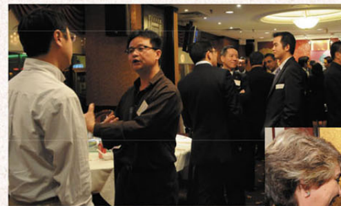
Members and Guests Mingling