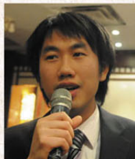
Leon Luo Enesoon New Energy