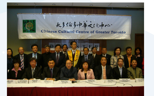
RHMBCA joined many other associations to organize fund raising events for earthquake and cyclone victims in Asia.