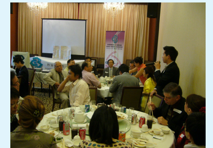
Members of RHMCBA introducing their businesses to other guests in the monthly membership event.