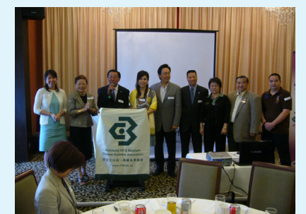
Directors of RHMCBA introducing the Board to members and guests at the membership event.

Come and join us at our biennial celebration for the Mid-Autumn Festival. The tradition of this important lunar calendar holiday is to get together. Your participation will make this union perfect. Time and location will be confirmed at a later date.