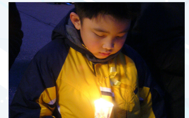
The damage of the earthquake was so devastating that a child from Richmond Hill could feel the pain of those parents who lost their children.