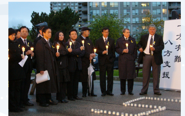
Representatives from the three levels of governments attended the candle light vigil for earthquake victims outside the Town of Richmond Hill.