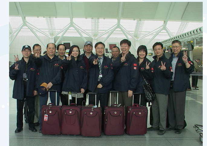
Delegation at the airport

The delegation visited Shanghai, Chengzhou, Shijiazhong, Chongqing, Guangzhou and Beijing. In Chongqing, the delegation came across the delegation led by Toronto Mayor David Miller.